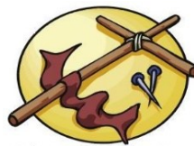
The Road to the Cross

A tradition that goes back to the Middle Ages. European pilgrims would travel to the Holy Land to walk the same steps as Jesus did in his final hours. The idea of having stations to represent each part of Jesus' journey came into practice for those who could not travel to the Holy Land themselves.